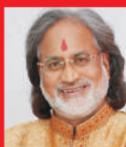
Pt. Vishwa Mohan Bhatt Instrumentalist