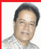
Anup Jalota ( Bhajan Samarat ) Indian Singer & Musician Lives in Mumbai