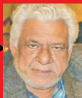
Om Puri Actor, Hindi Cinema